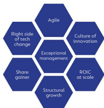
Figure 1 BUILDING BLOCKS OF A WINNING BUSINESS

A natural question following a period of strong performance is how we position the Fund from here? The winning businesses framework we introduced last year (Figure 1) remains a useful lens. In a dynamic and fast-changing world, we think owning winning businesses – when priced attractively – stacks the odds of outperforming over the long-term in your favour.