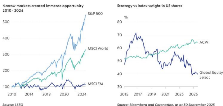
Figure 1 CONTINUING TO FIND OPPORTUNITIES OUTSIDE OF THE US

Last quarter, we discussed the emerging market (EM) trio of winning businesses Coupang, Nubank, and Sea Ltd. These companies have a history of strong innovation, having leveraged their leading platforms into new services and revenue streams, with strong growth outlooks underpinned by multiple structural tailwinds. And this quarter, four of the top 15 contributors were from emerging markets, with the list including Nubank, the abovementioned leading digital bank in Latin America; Taiwan Semiconductor Manufacturing Company (TSMC) which designs and manufactures nearly all of the world's most advanced semiconductor chips, holding a near-monopoly on the leading-edge process technology that powers AI innovation and cutting-edge computing; and Grab Holdings, which holds a dominant position in South East Asian ride-hailing alongside a strong presence in food delivery and fintech. Each of these businesses is on the right side of technological change, with a strong multi-year growth outlook that is superior to US-based peers, whilst trading at a fraction of the relative valuation.