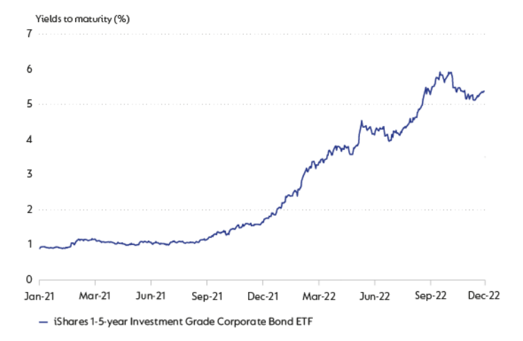
Figure 1 MOVES HAVE BEEN SIGNIFICANT IN THE SHORT-DATED INVESTMENT GRADE CORPORATE BOND MARKET

The chart below gives a sense for how significant the moves have been. For the iShares 1-5-year Investment Grade Corporate Bond ETF (a proxy for the short-dated investment-grade corporate bond market) yields to maturity have moved from 1% in 2021 to over 5% currently.