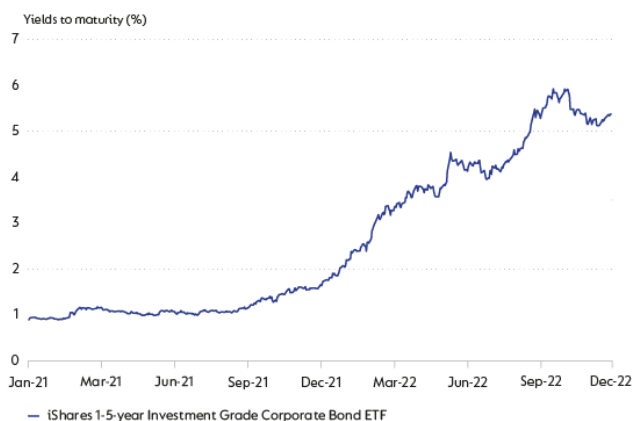
Figure 1 MOVES HAVE BEEN SIGNIFICANT IN THE SHORT-DATED INVESTMENT GRADE CORPORATE BOND MARKET

The chart below gives a sense of how significant the moves have been. For the iShares 1-5-year Investment Grade Corporate Bond ETF (a proxy for the short-dated investment grade corporate bond market) yields to maturity have moved from 1% in 2021 to over 5% currently.