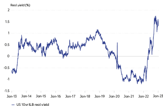
Figure 2 ILBs NOW MORE ATTRACTIVELY PRICED THAN THEY HAVE BEEN FOR THE LAST DECADE