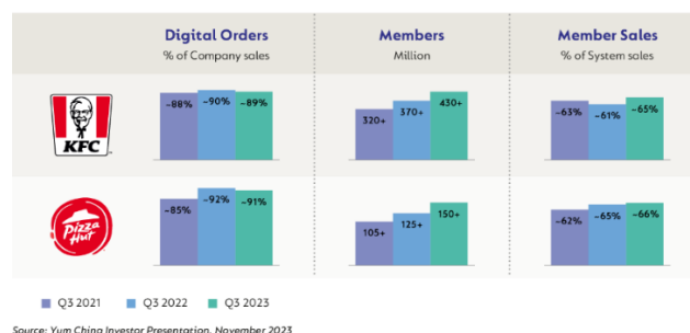
Figure 1 AT THE FOREFRONT OF DIGITAL INNOVATION

Management is also very shareholder-friendly, with over $210 million returned via dividends and share repurchases in Q3. Our team met the company in November and came away impressed, and with the conclusion that this is one of the best assets in China. The store base is currently 14 000 stores, and they are targeting 20 000 by 2026. The lower-tier cities have huge potential for new stores and most new stores break even within three months. They have also committed to return $3 billion in capital to shareholders (relative to a $16 billion market capitalisation).