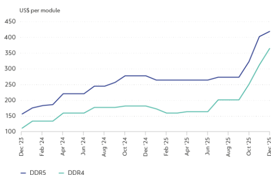
Figure 1 SERVER DRAM* CONTRACT PRICE

*Dynamic Random Access Memory